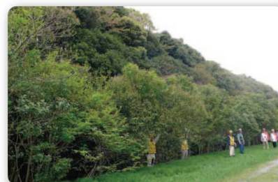
<Native Forest Built 30 Years Ago at Kimitsu Steel Works. Nippon Steel Corp.>

ROOTS (deep taproots stretch deep in the earth and forests are strong against disasters)